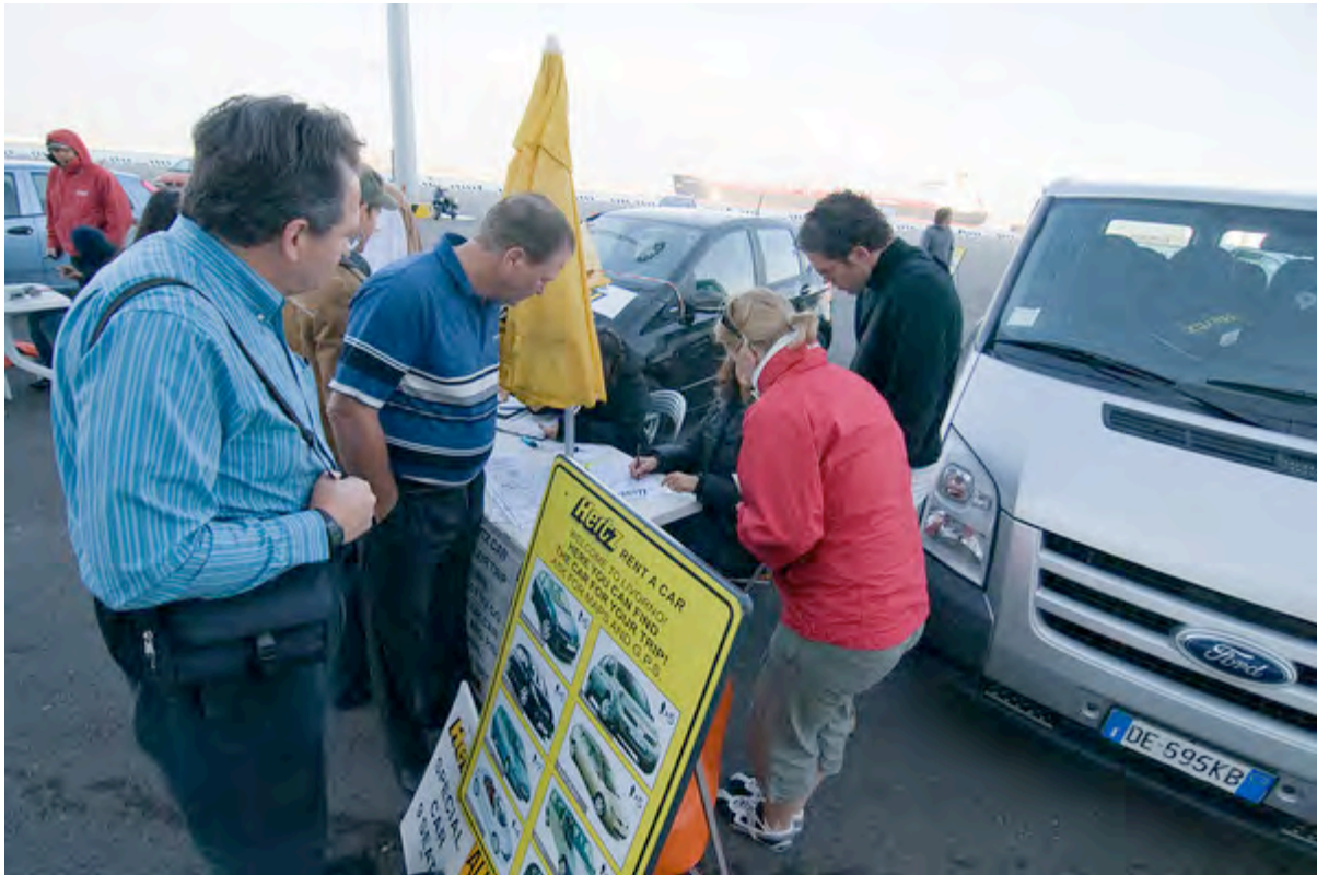
The women must have thought it was funny we were going to try to drive in Italy.